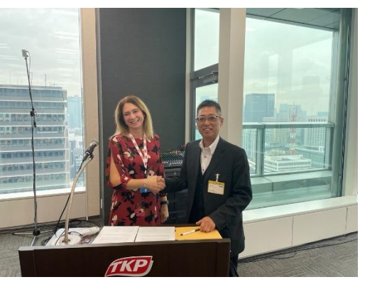
The 32nd BCOJ Annual Meeting was held on November 9-10, 2023. For the first time, TKP