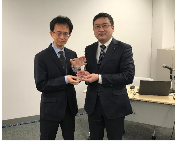
BCOJ Contribution Award Ceremony